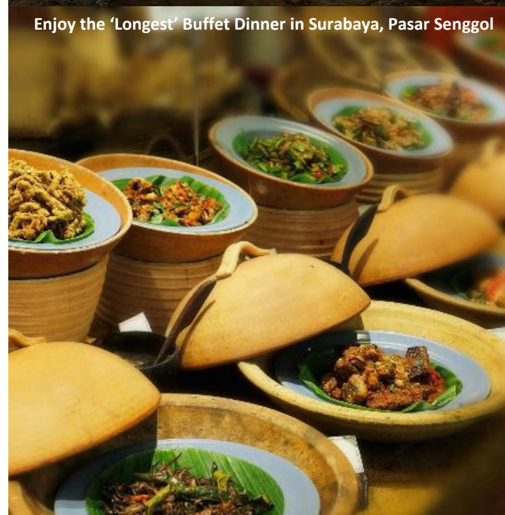
Enjoy the 'Longest' Buffet Dinner in Surabaya, Pasar Senggol