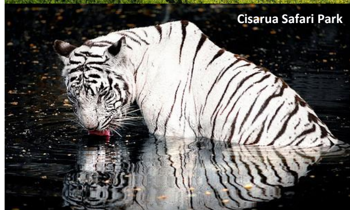
Cisarua Safari Park