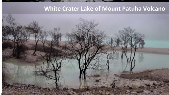
White Crater Lake of Mount Patuha Volcano