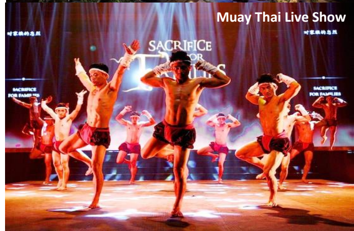
Muay Thai Live Show