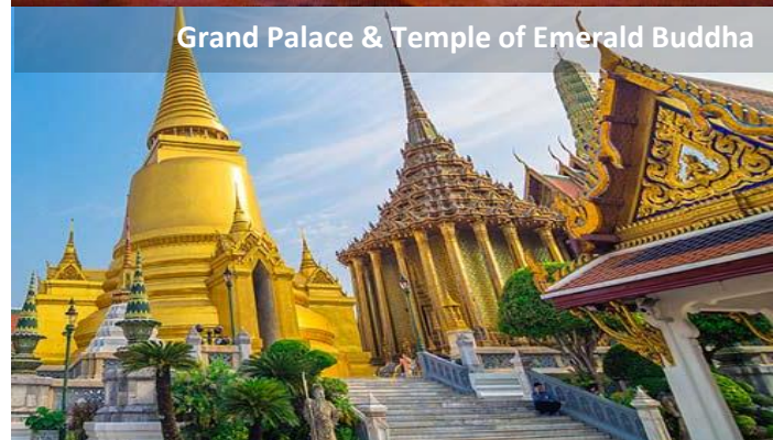
Grand Palace & Temple of Emerald Buddha