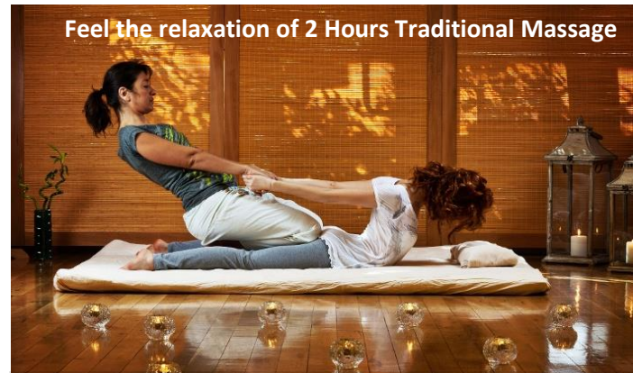
Feel the relaxation of 2 Hours Traditional Massage