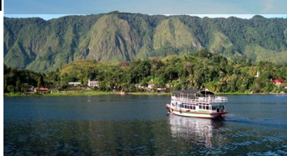
Panoramic View of Lake Toba