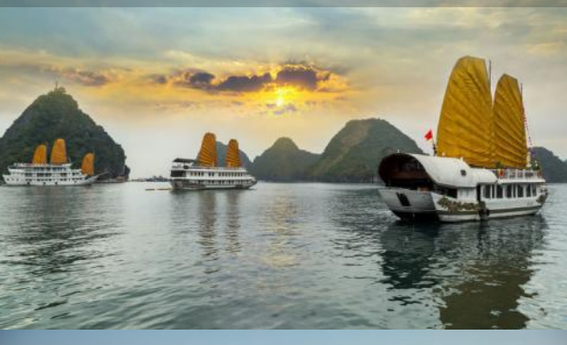
Admire the serene & natural surroundings