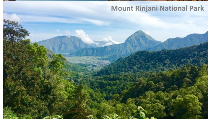
Mount Rinjani National Park