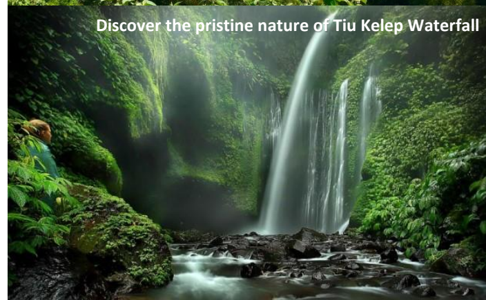
Discover the pristine nature of Tiu Kelep Waterfall