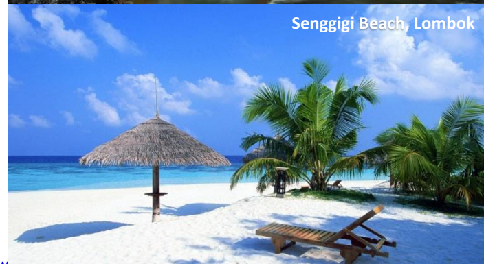
Senggigi Beach, Lombok