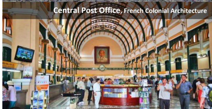
Central Post Office, French Colonial Architecture