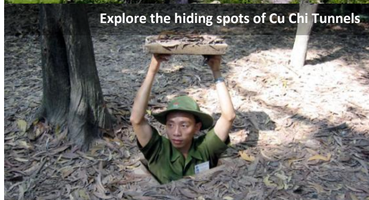
Explore the hiding spots of Cu Chi Tunnels