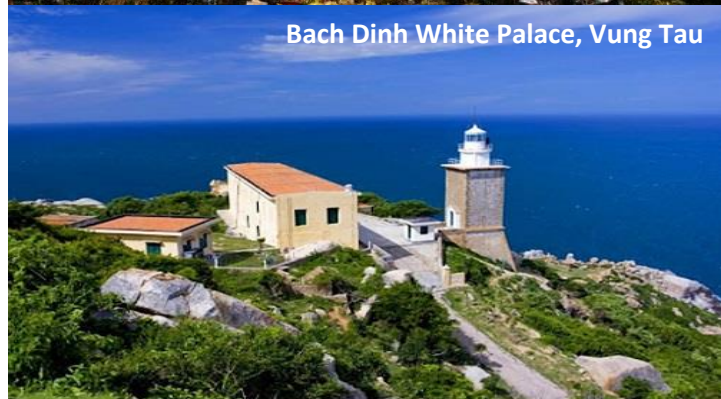
Bach Dinh White Palace, Vung Tau