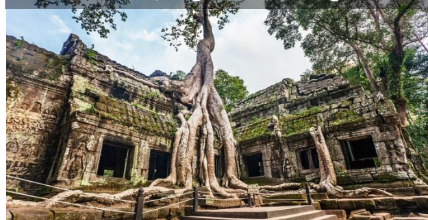
Baphoun Temple, Angkor Archaeological