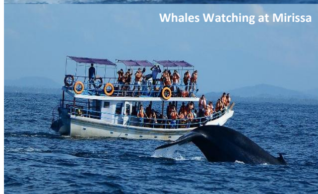
Whales Watching at Mirissa