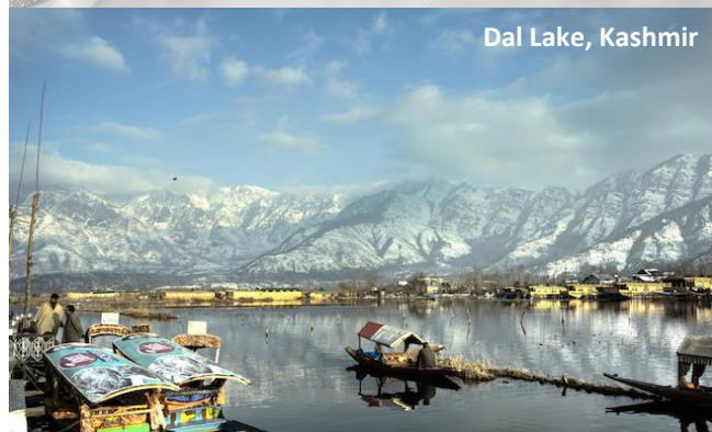
Dal Lake, Kashmir