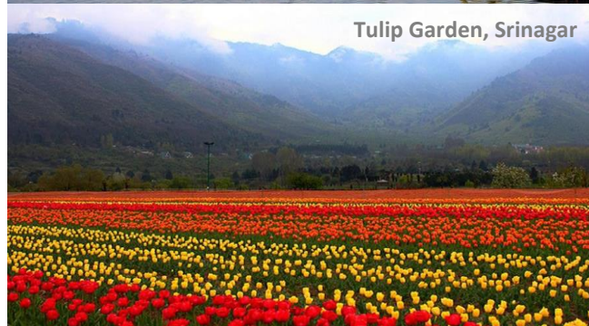
Tulip Garden, Srinagar