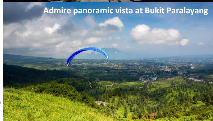
Admire panoramic vista at Bukit Paralayang