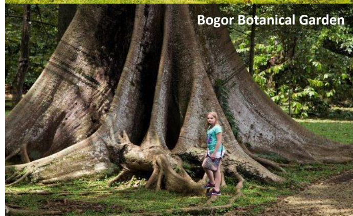
Bogor Botanical Garden