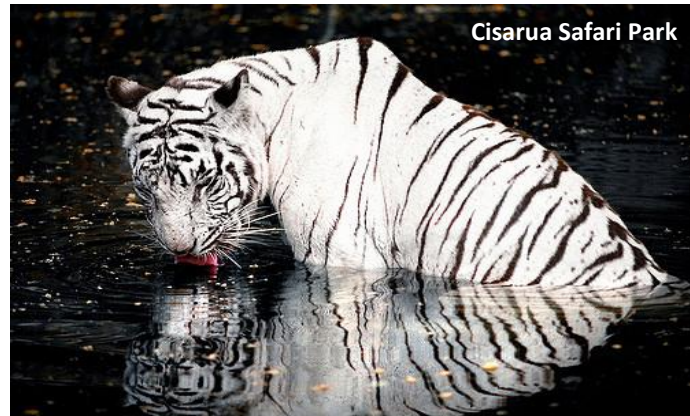
Cisarua Safari Park