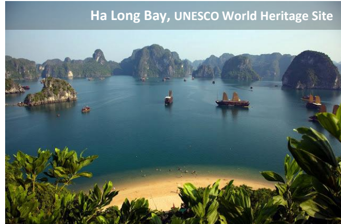
Ha Long Bay, UNESCO World Heritage Site