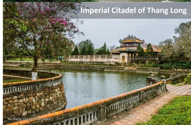
Imperial Citadel of Thang Long