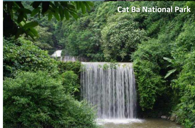
Cat Ba National Park