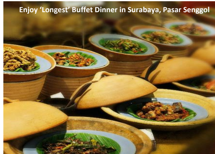
Enjoy 'Longest' Buffet Dinner in Surabaya, Pasar Senggol