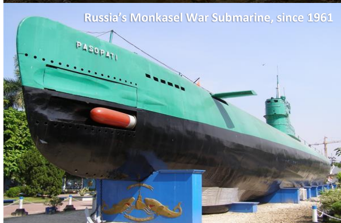
Russia's Monkasel War Submarine, since 1961