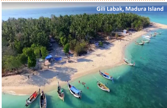
Gili Labak, Madura Island