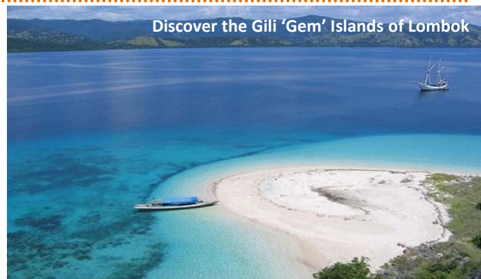
Discover the Gili 'Gem' Islands of Lombok