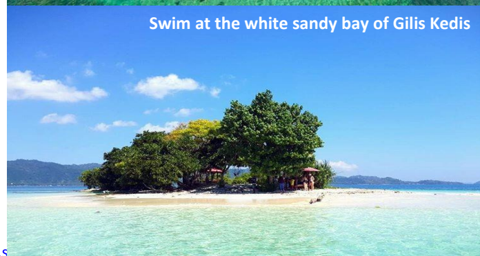
Swim at the white sandy bay of Gilis Kedis