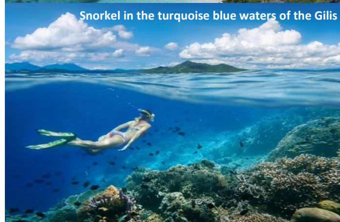
Snorkel in the turquoise blue waters of the Gilis