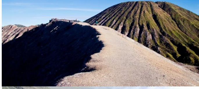
Climb up to the rim of Mt Bromo Volcano Crater