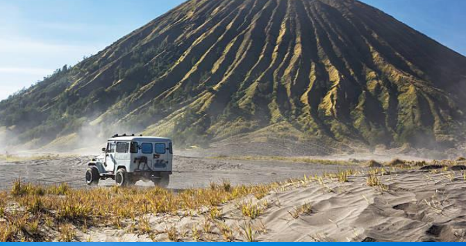
Cross the 'Sea of Sand' at the plain of Mount Bromo