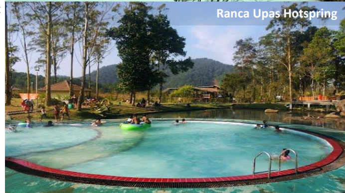
Ranca Upas Hotspring