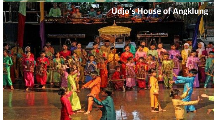
Udjo's House of Angklung