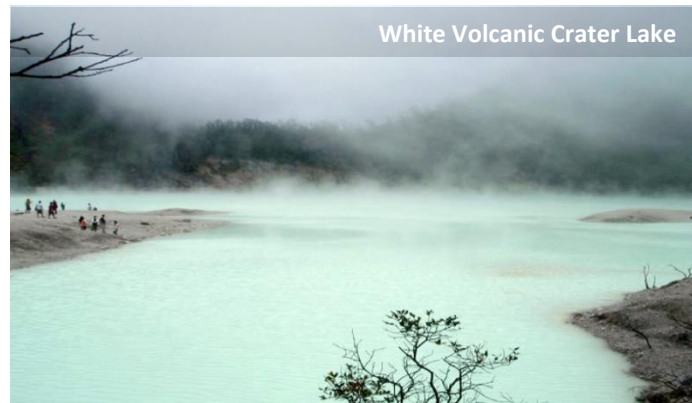
White Volcanic Crater Lake