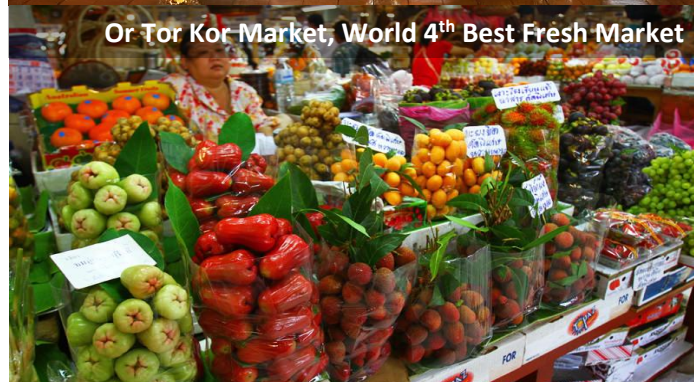
Or Tor Kor Market, World 4 th Best Fresh Market