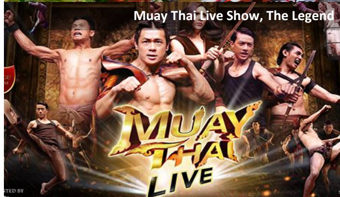
Muay Thai Live Show, The Legend