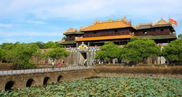
Thien Mu Pagoda, Hue