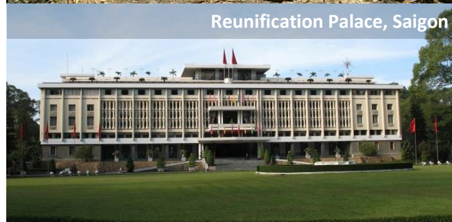
Reunification Palace, Saigon