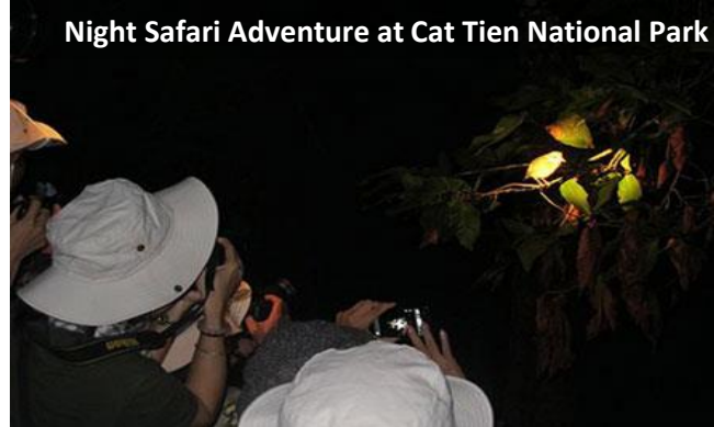
Night Safari Adventure at Cat Tien National Park