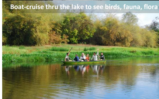
Boat-cruise thru the lake to see birds, fauna, flora