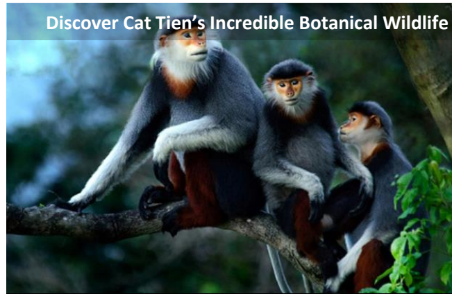
Discover Cat Tien's Incredible Botanical Wildlife

0700 Enjoy breakfast at hotel 0900 Discover the French Colonial City of Saigon • War Remnants Museum • Selfie-photography at Reunification Palace • Central Post Office (French colonial Architecture) • Notre Dame Cathedral (French colonial Architecture) TBA Transfer to the airport for flight check-in TBA Depart for home by Flight TBA