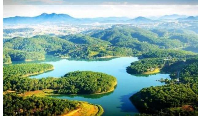
Cable car ride from Robin Hill to Tuyen Lam Lake