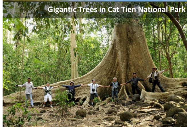
Gigantic Trees in Cat Tien National Park