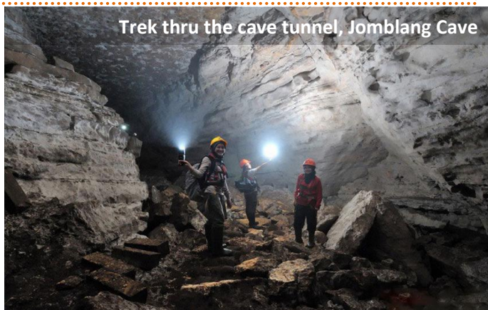
Trek thru the cave tunnel, Jomblang Cave