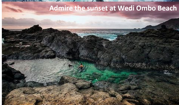
Admire the sunset at Wedi Ombo Beach