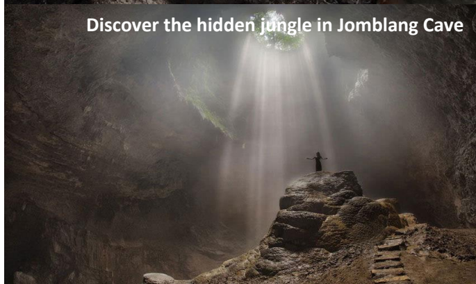
Discover the hidden jungle in Jomblang Cave