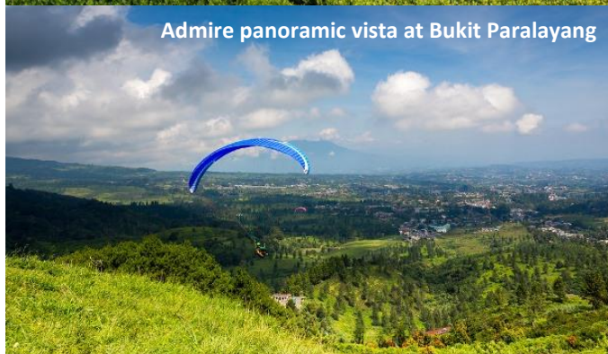
Admire panoramic vista at Bukit Paralayang