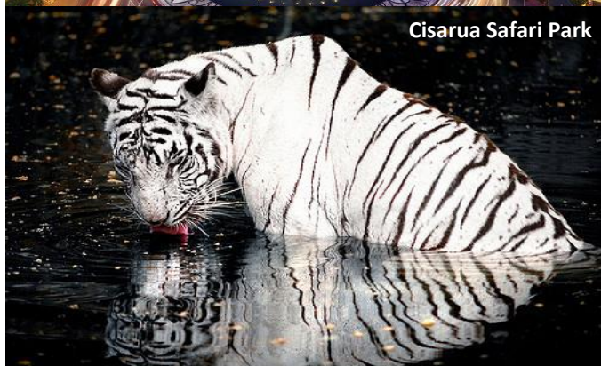
Cisarua Safari Park