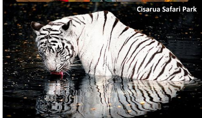
Cisarua Safari Park