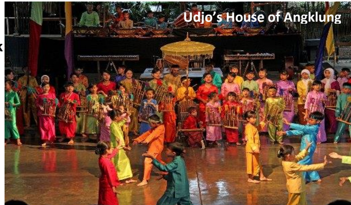
Udjo's House of Angklung