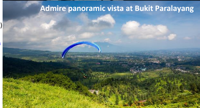
Admire panoramic vista at Bukit Paralayang