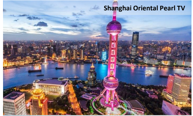
Shanghai Oriental Pearl TV