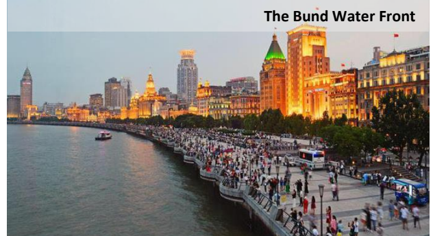
The Bund Water Front