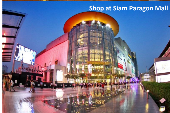
Shop at Siam Paragon Mall