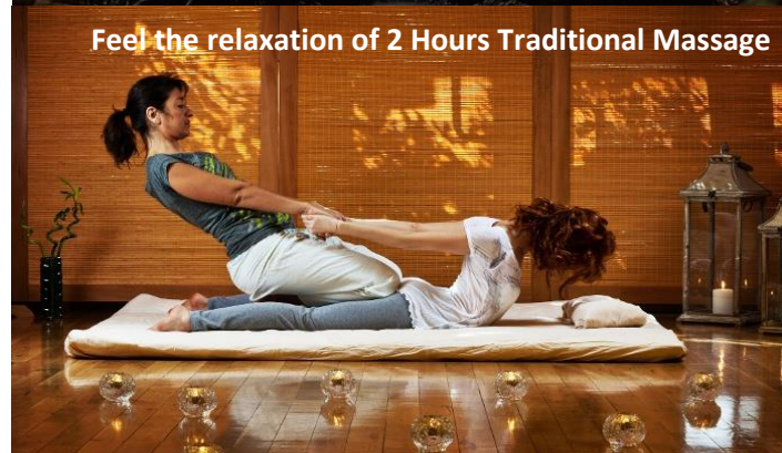
Feel the relaxation of 2 Hours Traditional Massage