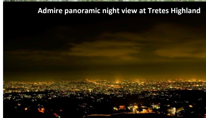
Admire panoramic night view at Tretes Highland