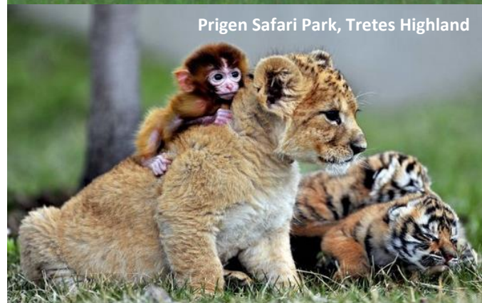
Prigen Safari Park, Tretes Highland