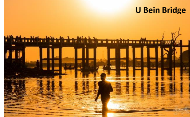
U Bein Bridge