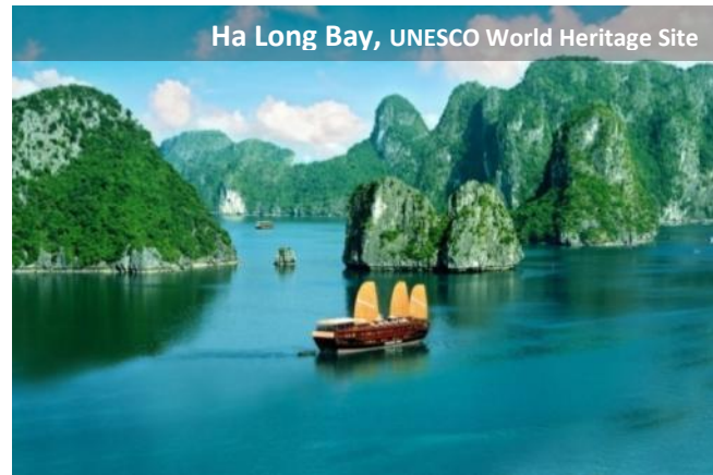
Explore the Heaven Cave & Dau Go Grotto