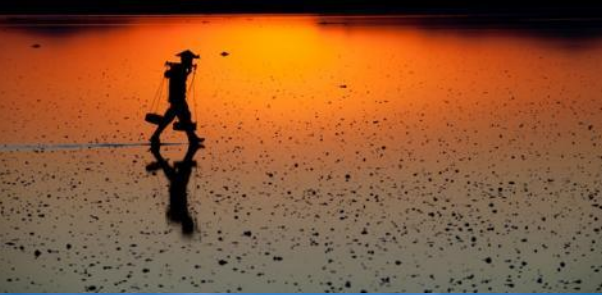
Mui Ne's Red Sand Dunes