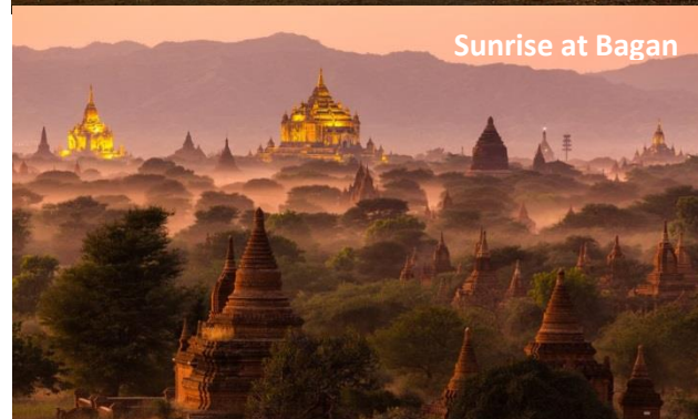
Sunrise at Bagan