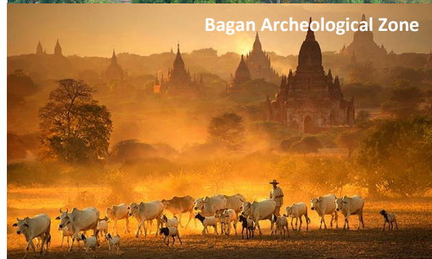
Bagan Archeological Zone