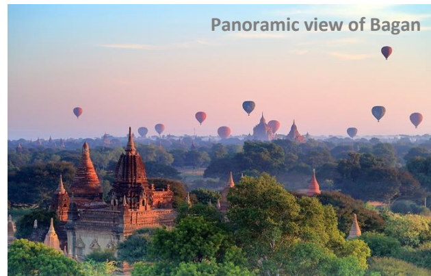
Panoramic view of Bagan