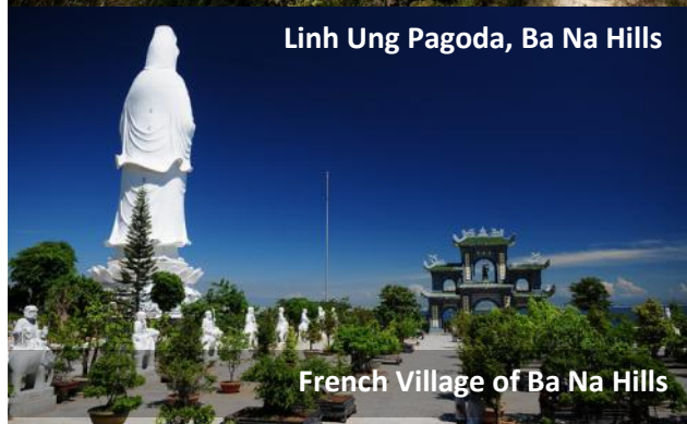
French Village of Ba Na Hills