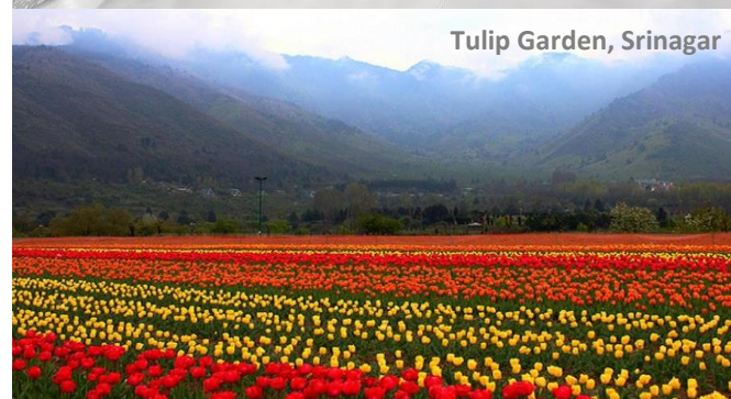
Tulip Garden, Srinagar