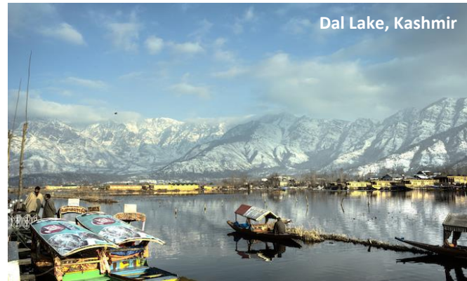
Dal Lake, Kashmir