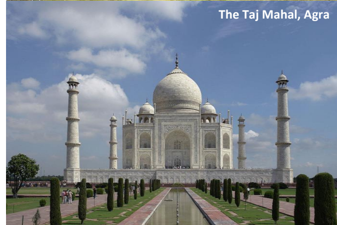
The Taj Mahal, Agra