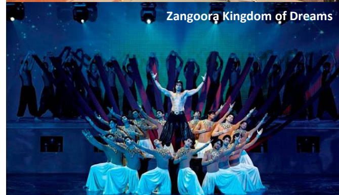
Zangoorā Kingdom of Dreams