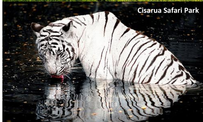
Cisarua Safari Park