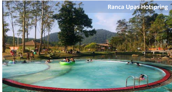
Ranca Upas Hotspring