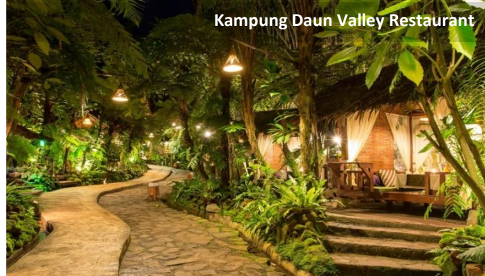
Kampung Daun Valley Restaurant