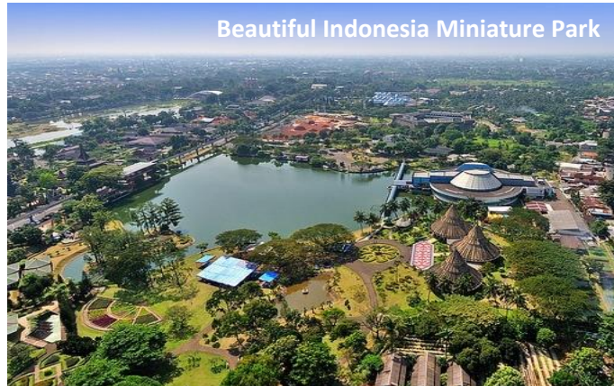
Beautiful Indonesia Miniature Park