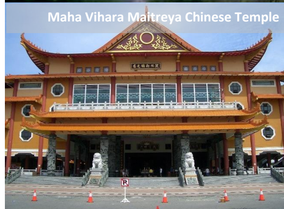
Maha Vihara Maitreya Chinese Temple